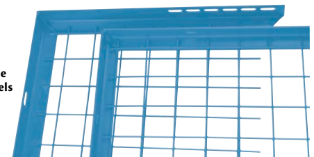
Adjustable Filler Panels

Adjustable filler panels fill in blank spots on the ends of wire mesh partitions to plug up potential security risks. Filler panels come in two sizes: 1' x 4' and 1' x 8' that slide over the ends of existing wire mesh sections. Bolt holes on the filler panels are separated per every inch and allow the filler panel to fill in a space between 6" and 10" wide. The holes line up with holes on the existing panel which are drilled in at the top and bottom to securely fasten the filler panel in two places.